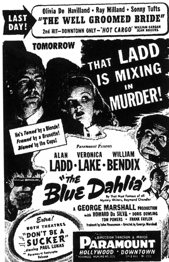
July 1946 "Now Playing" AD for "The Blue Dahlia"