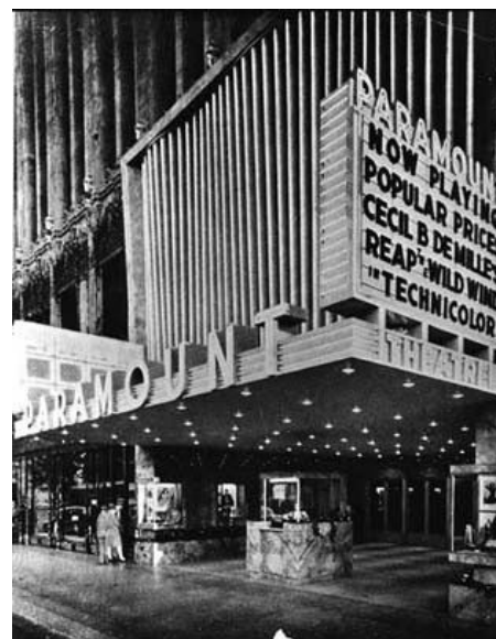
Hollywood Paramount circa 1942 6838 Hollywood Blvd. (Now known as THE EL CAPITAN THEATRE)