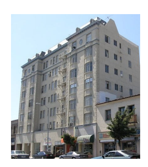
Guardian Apts 5217 Hollywood # 726