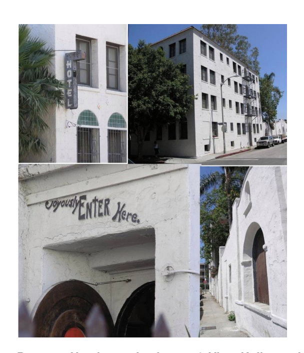
Brevoort Hotel, near Lexington & Vine, Hollywood

8/27/46 At 11:30 p.m. she checked out of the Brevort Hotel.