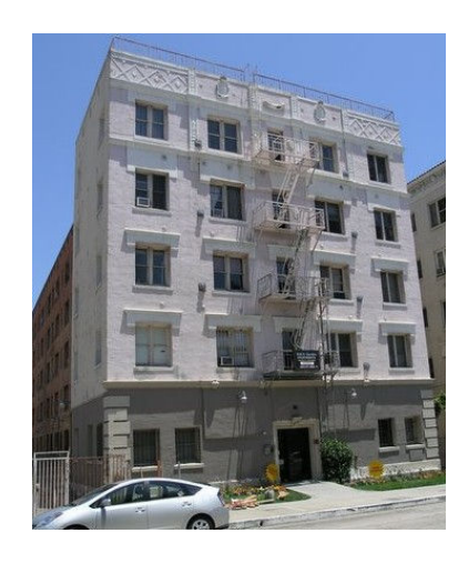
Chancellor Apts 1842 N. Cherokee Ave #501