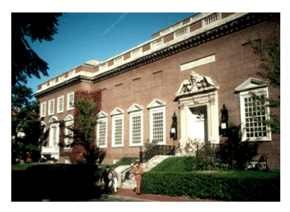
HARVARD UNIVERSITY -- THE FOGG ART MUSEUM

The Fogg Art Museum, which opened to the public in 1895, is Harvard's oldest art museum. Around its Italian Renaissance courtyard, based on a sixteenth-century façade in Montepulciano, Italy, are galleries illustrating the history of Western art from the Middle Ages to the present, with particular strengths in Italian early Renaissance, British pre-Raphaelite, and nineteenth-century French art.