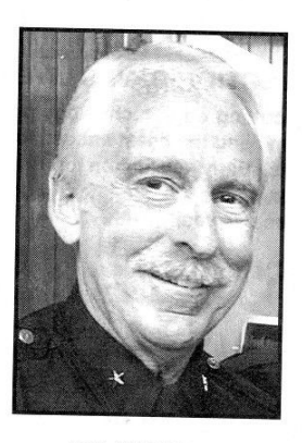
JIM TATREAU The LAPD commander urged the department to use DNA and fingerprint technology databases to help solve cases.