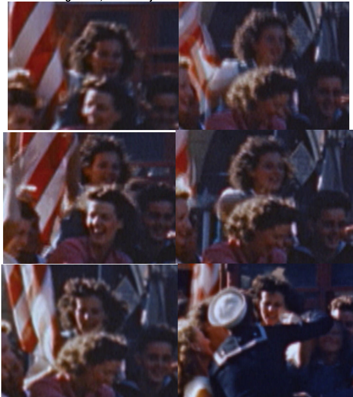
August 15, 1945 Hollywood Blvd-- VJ DAY celebration