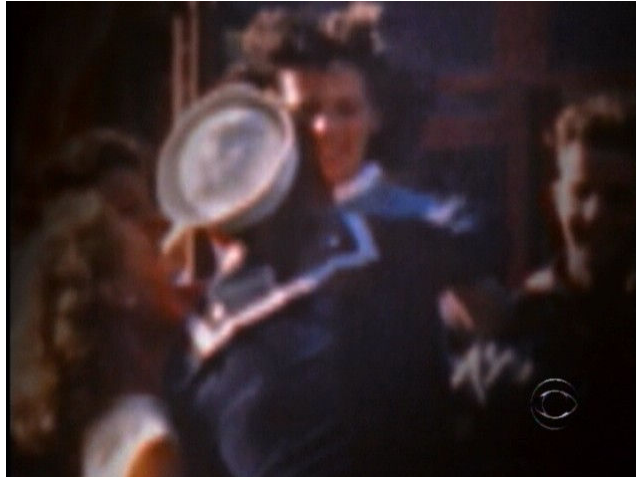
August 15, 1945 VJ Day Hollywood Bl., near Cherokee Ave