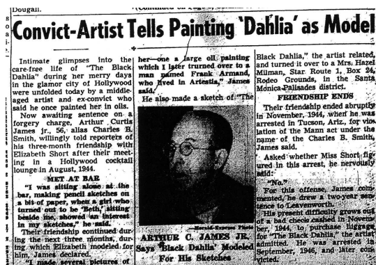
Article placing Elizabeth Short in Hollywood Aug-Nov. 1944