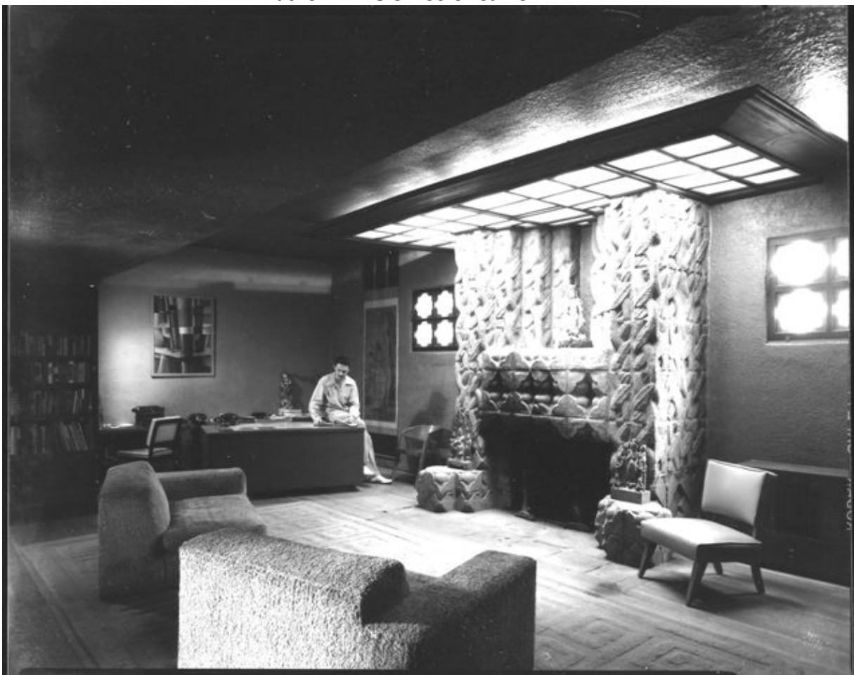
Father in his office circa 1947

(During the 1950 DA/LAPD surveillance, a microphone was hidden in the wall of this room. As referenced in BDA, in 1952 the new owner, after living in the residence for over a year, discovered a large quantity of pornographic photographs hidden in the overhead skylight near where father is shown seated. The pornographic photos were of father along with other unidentified males and females. The owner described them as “kinky” and indicated he destroyed all of them.