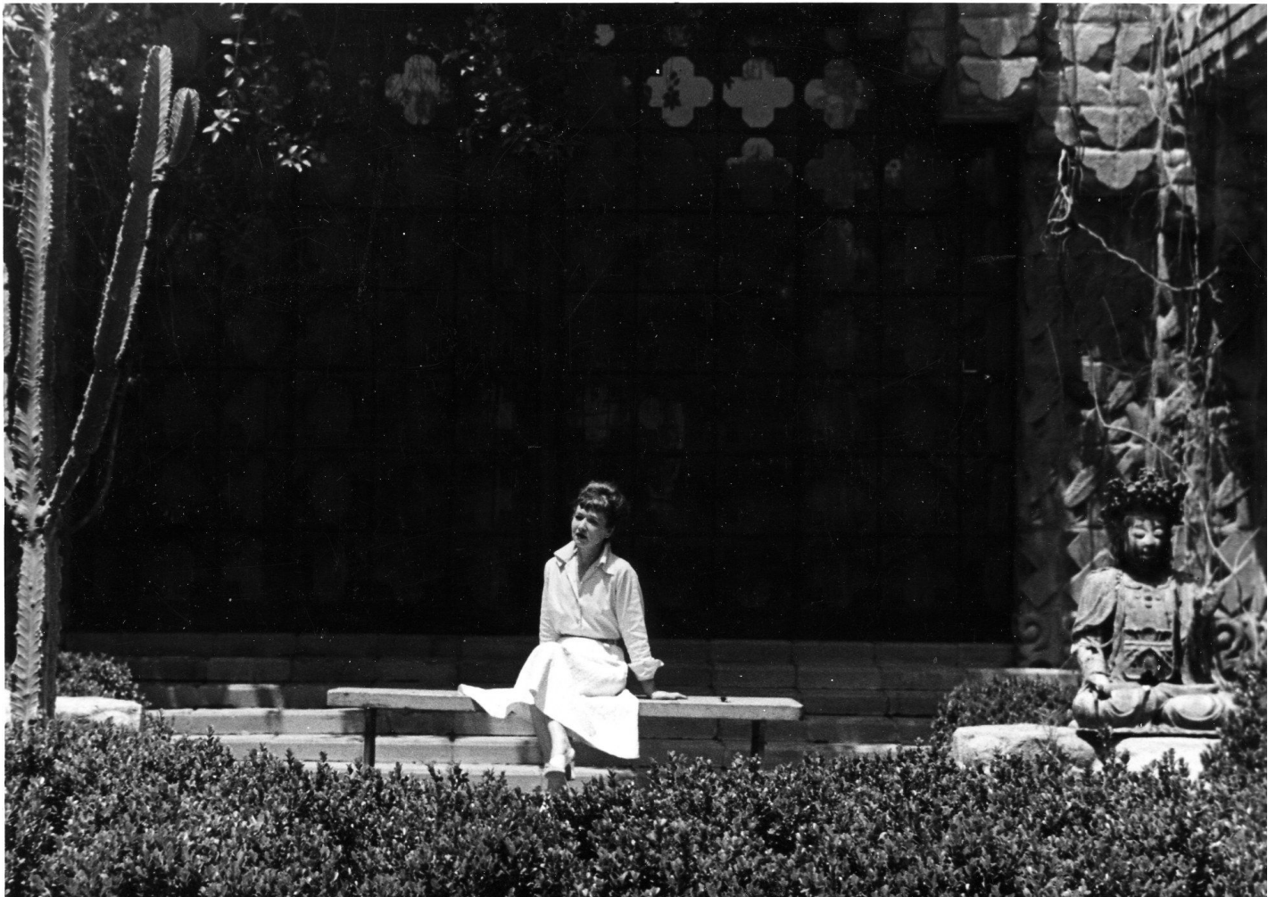
Mother in courtyard circa 1947