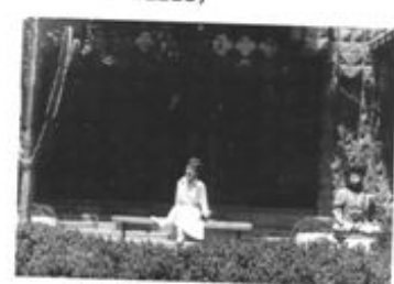
Mother circa 1946