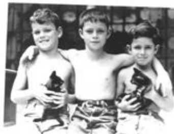
The Three Musketeers