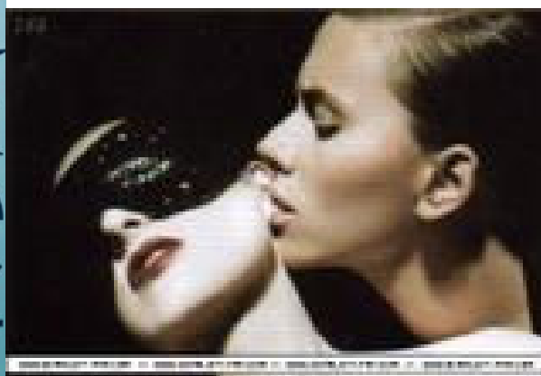
Scarlett Johansson & Dita Von Teese ( Flaunt Mag. Oct. 2006)

No. I was not involved with the film, nor did I have the pleasure of meeting Ms. Johansson. Let me repeat that my book has nothing to do with the fictional story written by James Ellroy. Ellroy's novel was written twenty-years ago and the De Palma film was an adaptation of that novel, and has nothing to do with the real facts of the case.