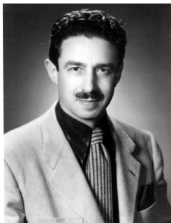
George Hodel 1949