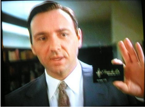
Kevin Spacey as detective Sgt. Jack Vincennes holding Pierce Patchett's Fleur dy Lis business card "Whatever You Desire"