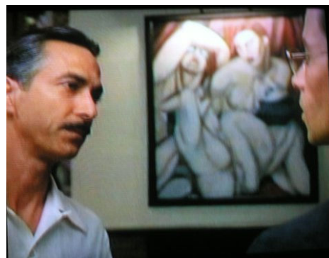
David Strathairn as "Pierce Patchett"